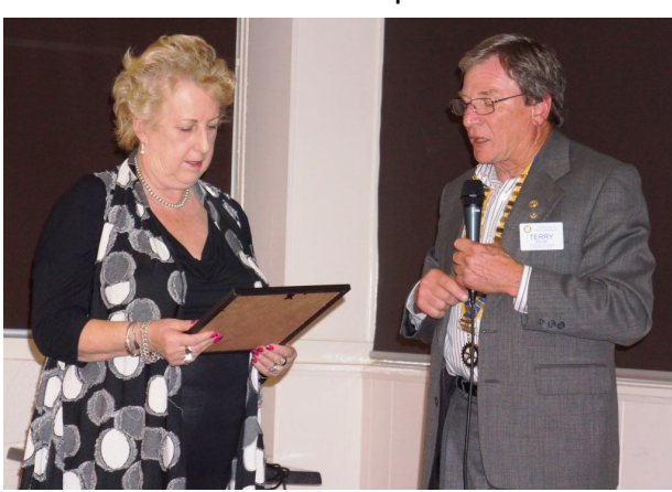
Presentation of Certificate