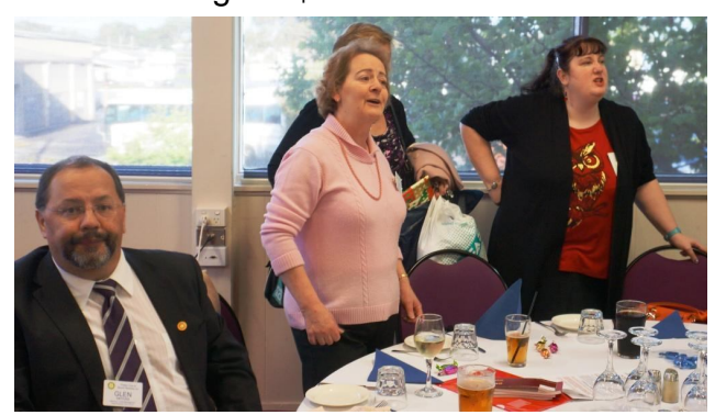
A gaggle of Geese and bewildered Gander