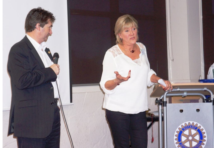
CONGRATULATIONS & CELEBRATIONS