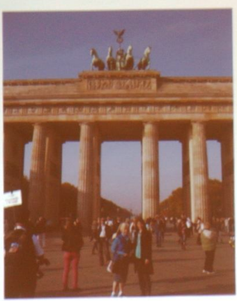
Her Ambassadorial Scholar Destination