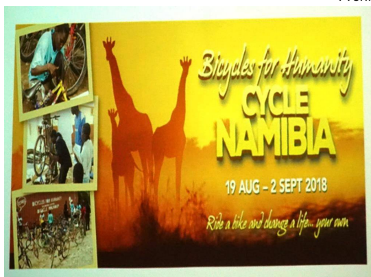
Bike Ride in Namibia