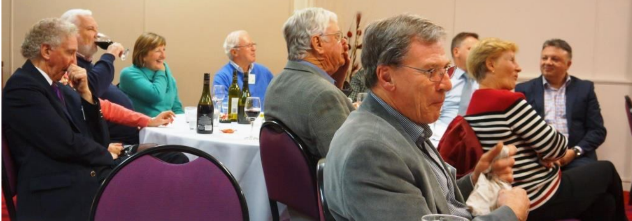
The Members enjoying Philips presentation