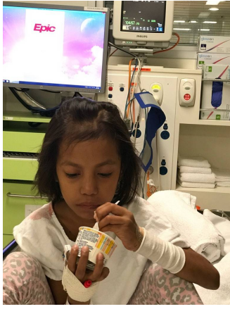
Ice cream fixes everything

their dental procedures. Her Orthopaedic doctor has also ordered another MRI and a CT scan to get a better view of the damage done to the vertebrae by the tumour before radiation can commence.