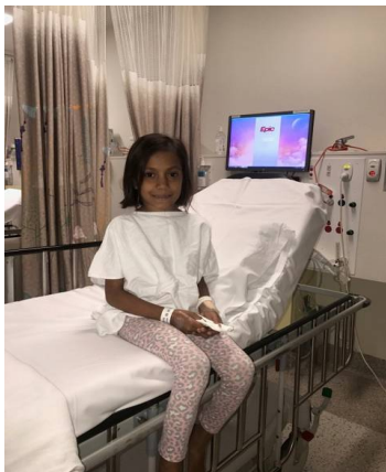
Waiting for dental work