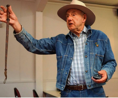
Showing us how to keep the weight off