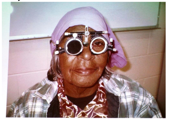
A local patient