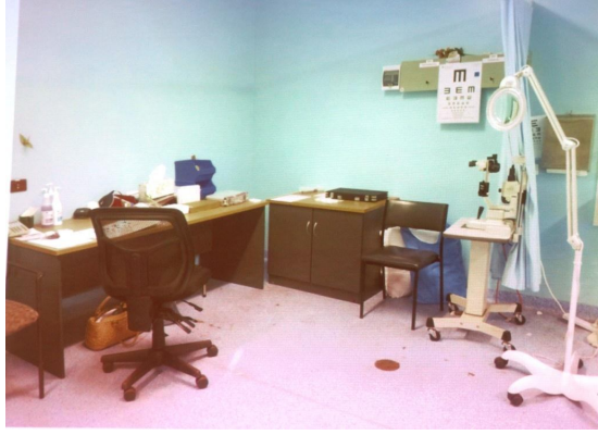
Optometry in the NT.