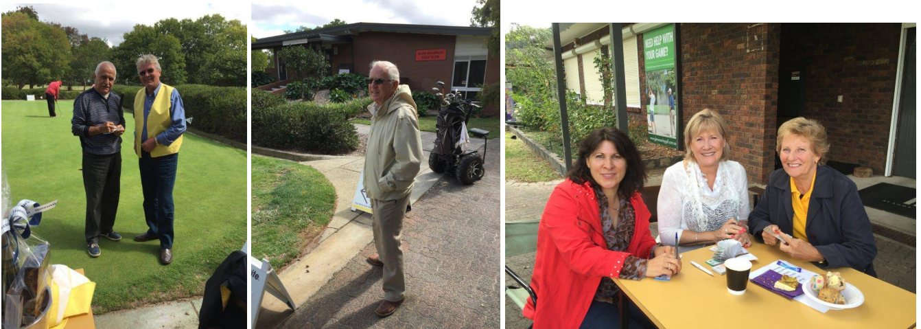
Various photos from the Rotary Club Mount Waverley Good Friday Golf Day