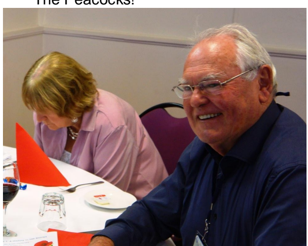
And here's my "I want to be here" smile?