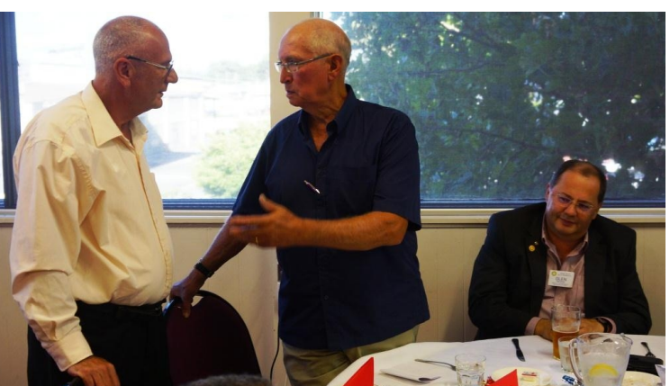
Is that a gun in your pocket?