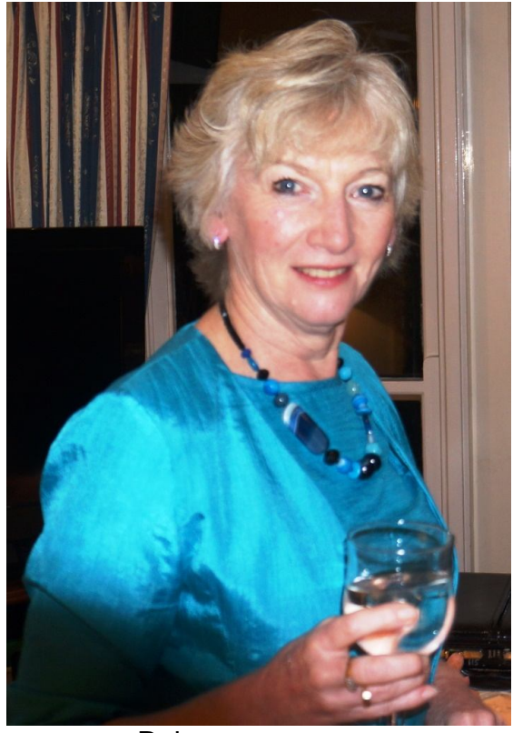
Reason for the night