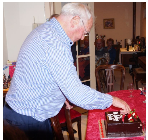
Do I have enough breath for all of those Candles......Yes I do!