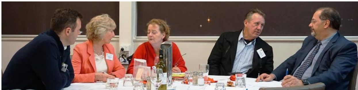
Table 1 brainstorming