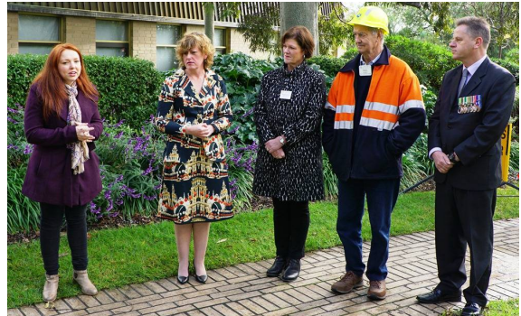
Other Attendees at the commemoration