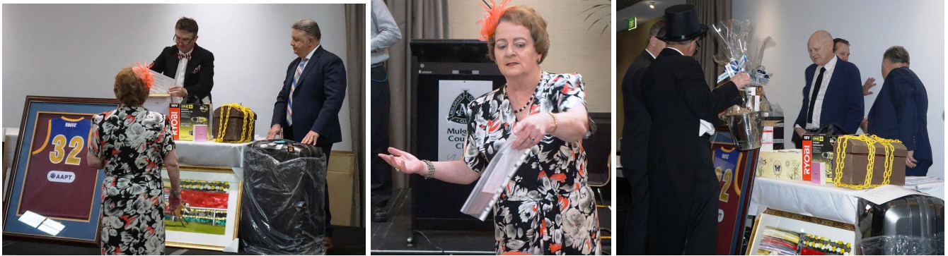
Various photos from Calcutta night