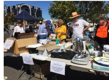
Photos from last weeks fundraiser at Oakleigh Market