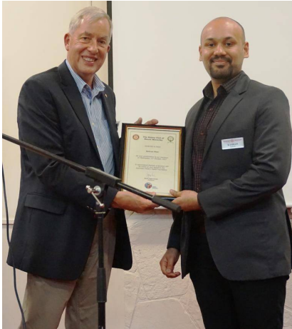
Certificate of thanks