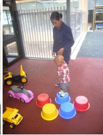
Stepping stones with Grandma