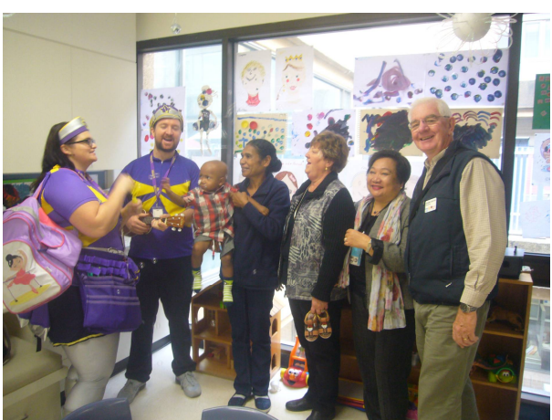
Captain Starlight blowing bubbles