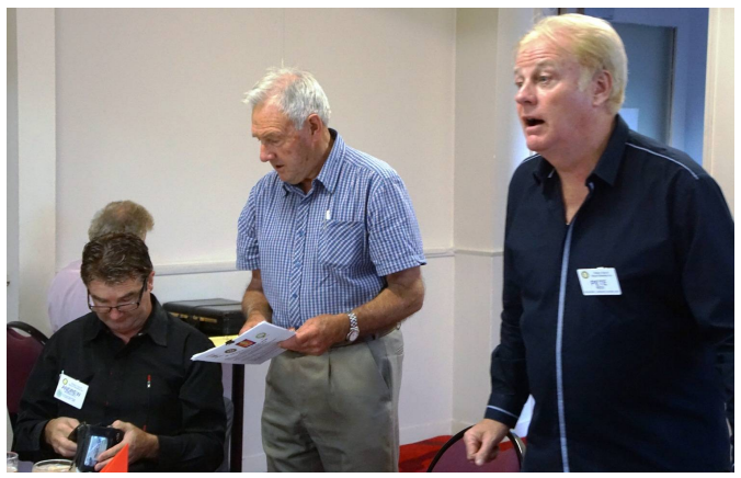
I thought I already paid you?