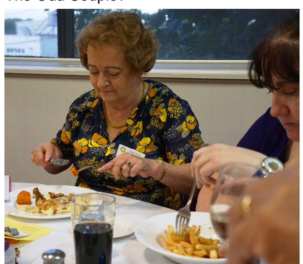
On No, not chicken again!