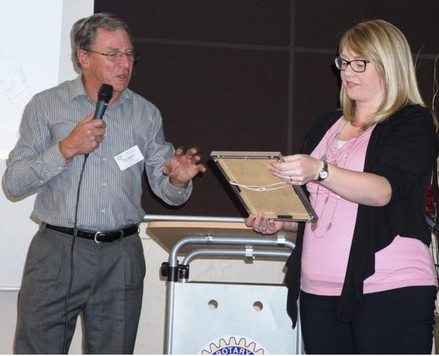
Presentation of Certificate of Appreciation