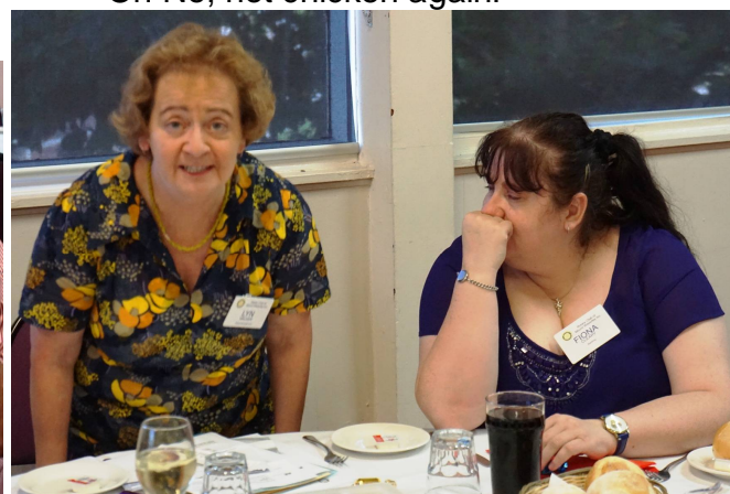
Yes its another new dress!