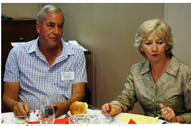
Oh No, not chicken again!