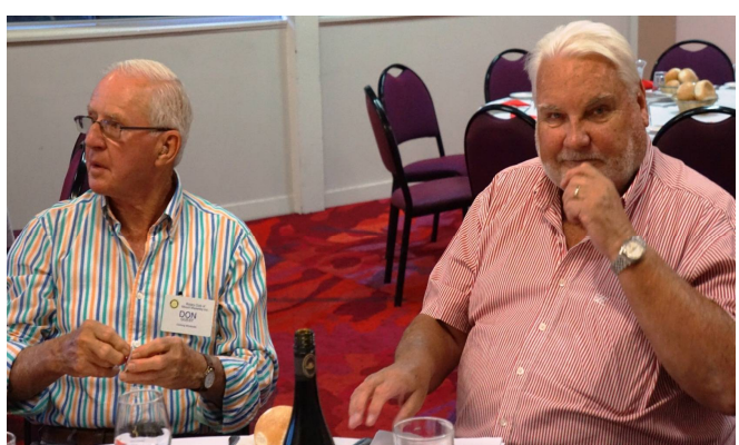
The Odd Couple?