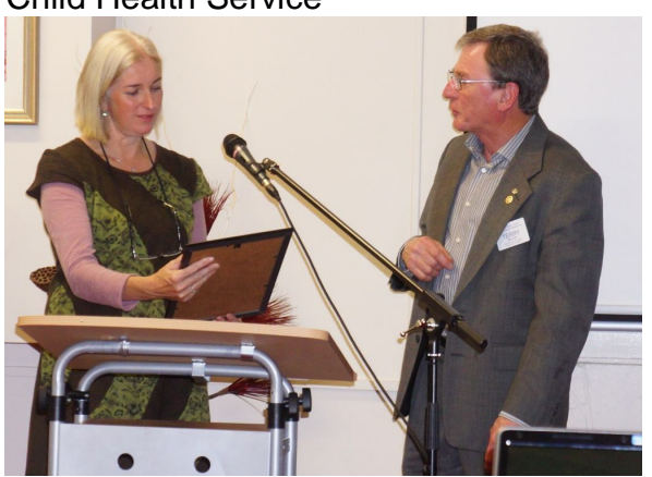
Presentation of Certificate of Appreciation.