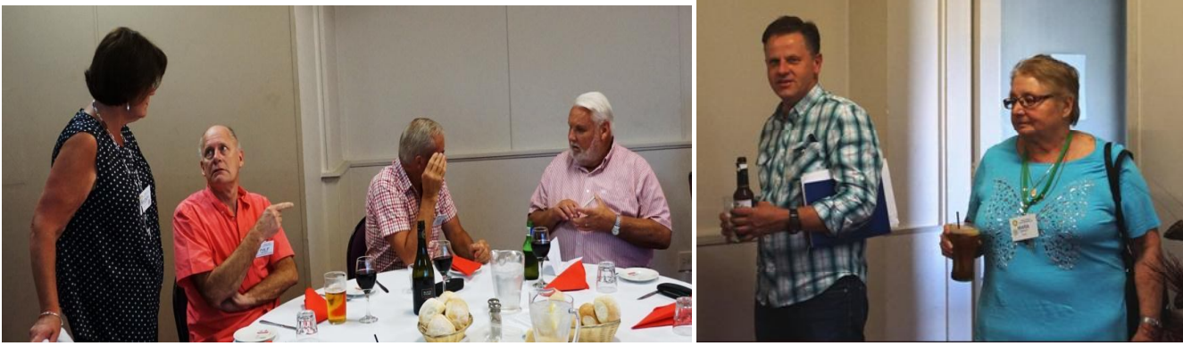
"Hey Mummy, He's ignoring me..."