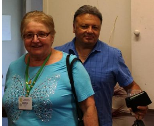
Stalker or Body Guard?