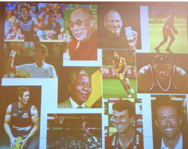
Some mindful practitioners