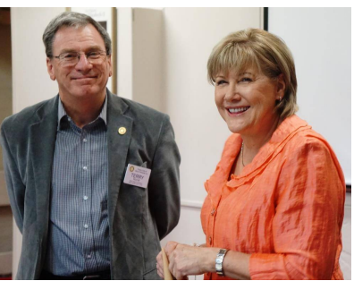
Hari Chrishna's are back