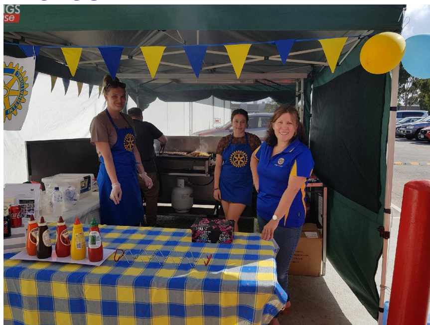
Bunnings BBQ fundraiser