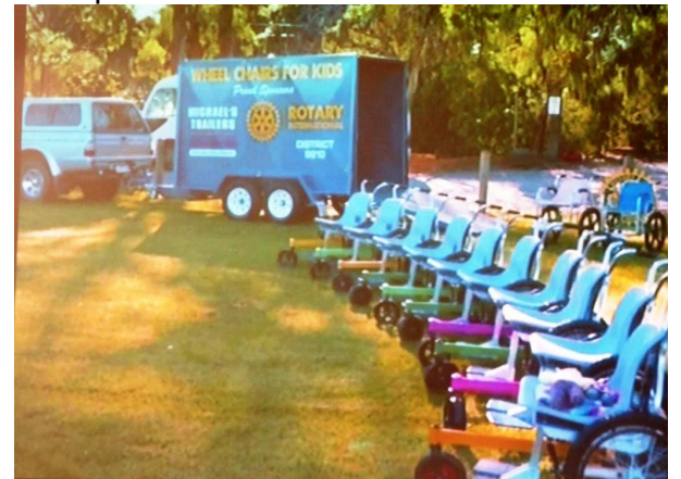
School wheelchairathon raising funds for WCK.