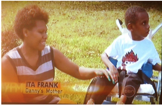
Recipient from Vanuatu