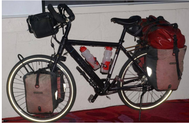
The Bike that did the trek