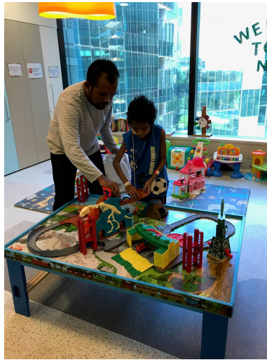
Found the games room