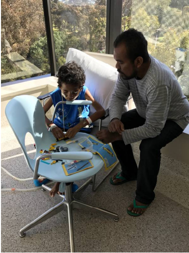
Out of bed