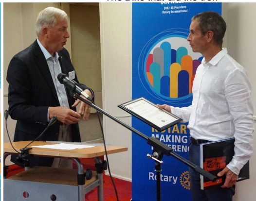
Certificate of Thanks